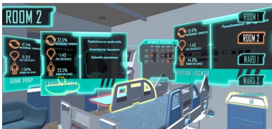
Virtual-reality visualisation of metagenomic data for infection control in smart hospitals

Findings were made by A*STAR's Genome Institute of Singapore (GIS), through its analysis of genetic sequences of microbes and multi-drug resistant organisms found in hospital environments